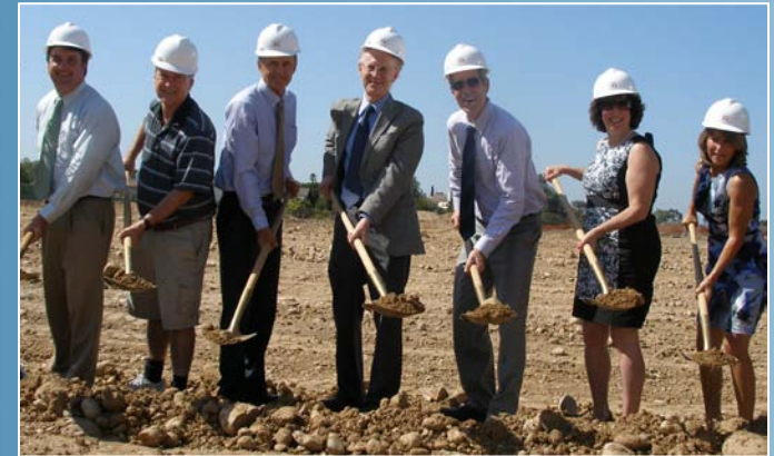
Jonas Salk Elementary School groundbreaking