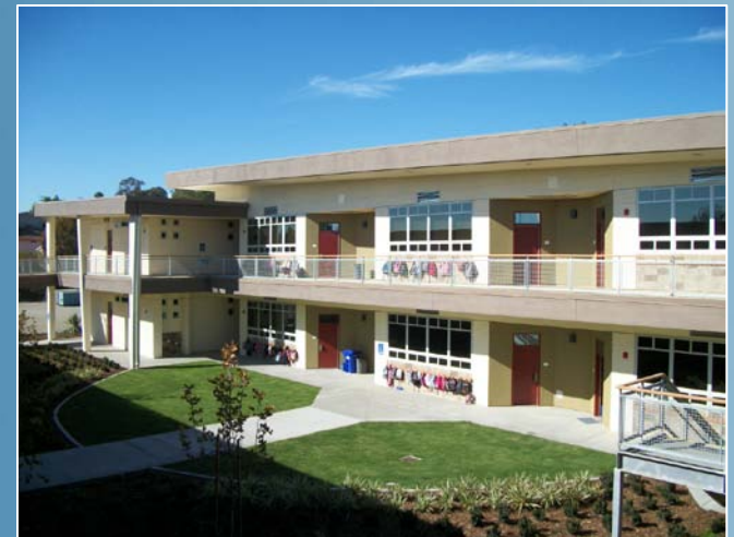
New Classroom Building at Encanto ES