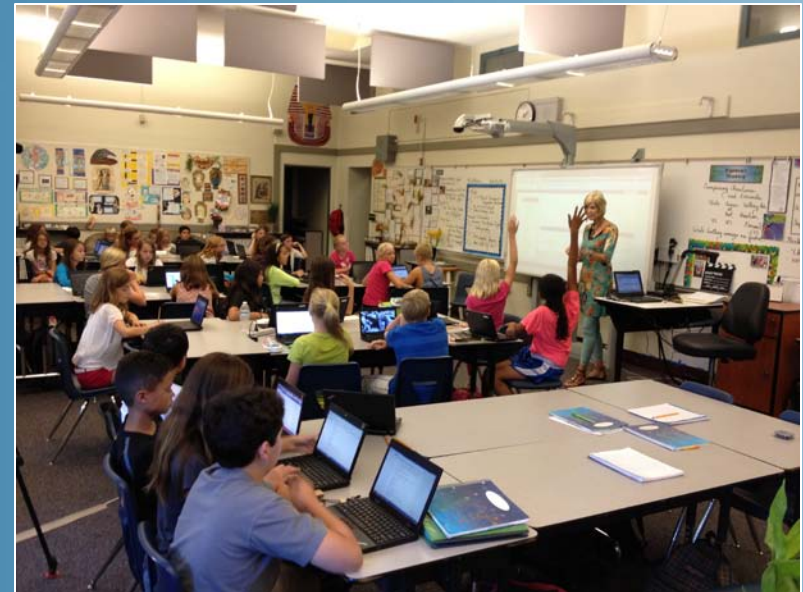
i21 classroom at Dana MS