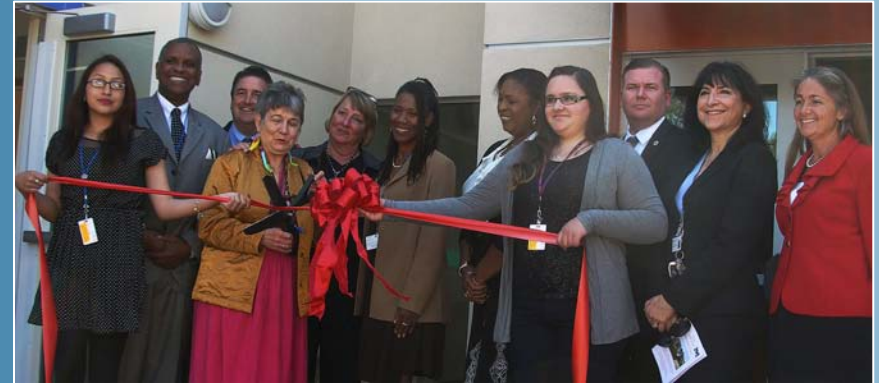
Dedication of Morse High School's Child Development Center

ICOC members and staff tour performing arts center at CPMA Middle School