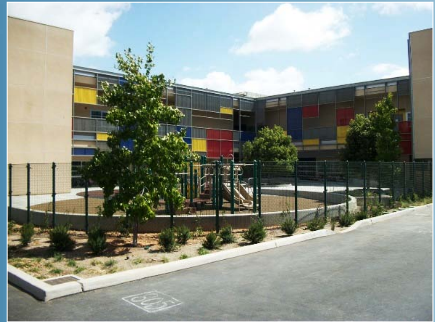
New Classroom Building at Language Academy