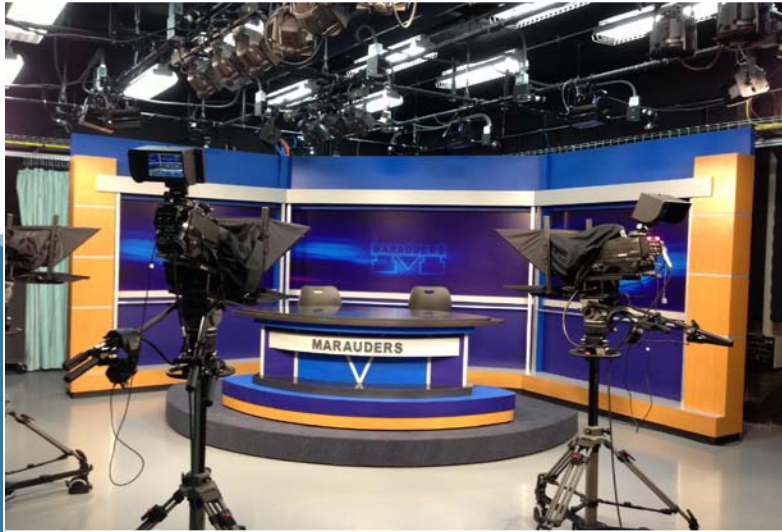
Mira Mesa HS Multimedia Facility