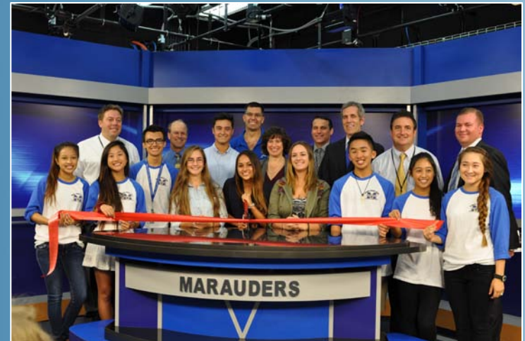
Mira Mesa High School Multimedia Facility