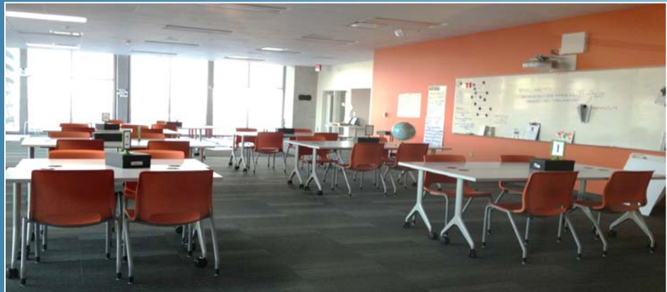
New e3 Civic High School Classroom