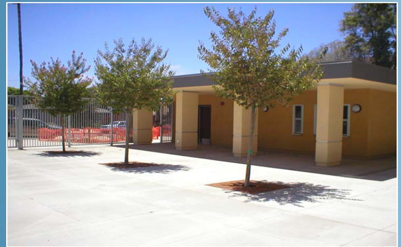
New Restroom and Concession Stand at Point Loma High School