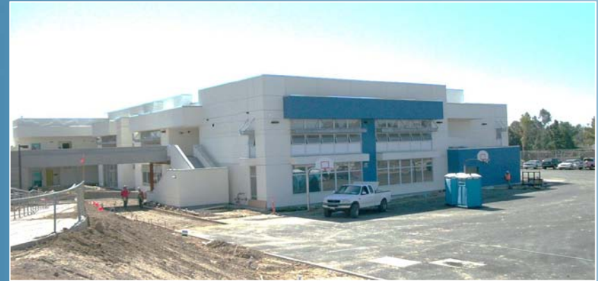
New Classroom Building at Knox