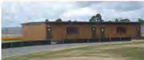
Interim Classrooms during construction