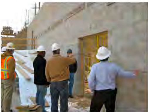
ICOC reviews PAC construction