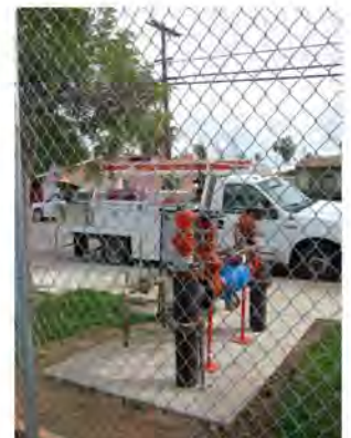
New back-flow preventor for PAC fire protection system