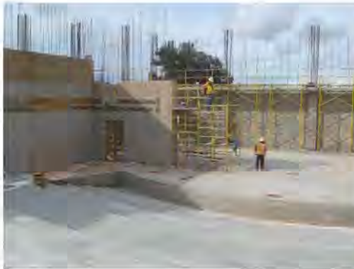
PAC - Stage area