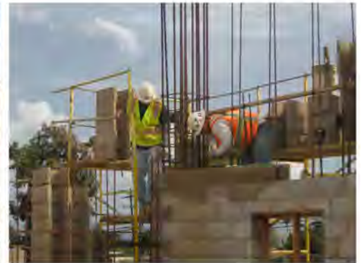
PAC - exterior walls