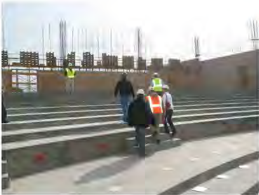
PAC - Theater seating area