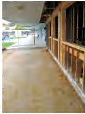
WSM Bldg 300 - New exterior walls, doors, windows