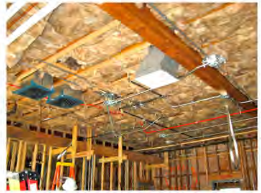
WSM Bldg 300 - Interior Bldg Systems