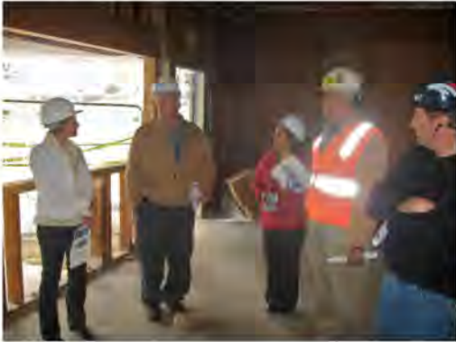
WSM Bldg 300 - ICOC Briefing