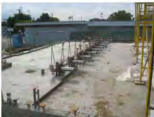
PAC - public toilet area near main entrance