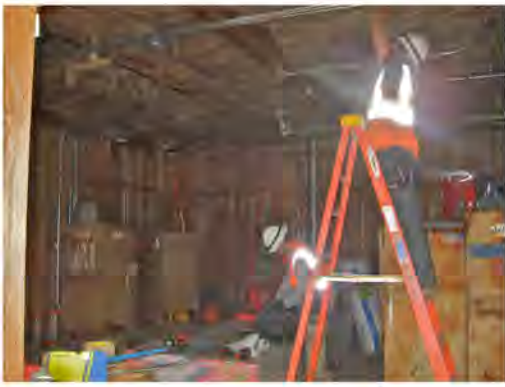
Whole Site Renovation (WSR) Bldg 300 special ed classrooms