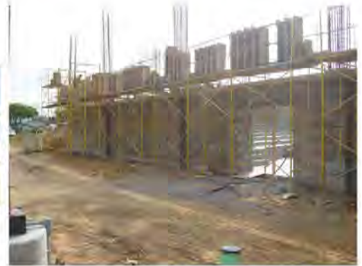
Performing Arts Center (PAC)