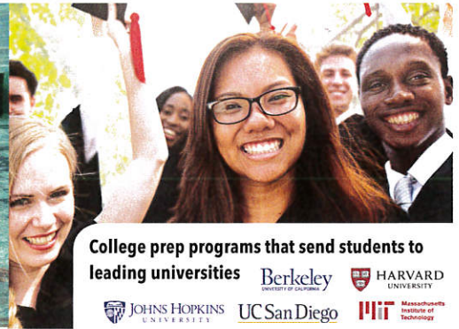
College prep programs that send students to leading universities