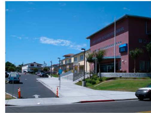
ELEVATIONS ZAGRODNIK + THOMAS ARCHITECTS